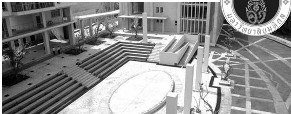
College of Music, Mahidol University

As this is my first letter as the Australasian correspondent, I want to introduce myself. After finishing my dissertation in 2006, I spent two years as a visiting lecturer—first at the University of Tennessee and then at the New Zealand School of Music. It was that experience, I believe, that gave me the courage to accept the opportunity at Mahidol University in Thailand where I have now been for a little over two years.