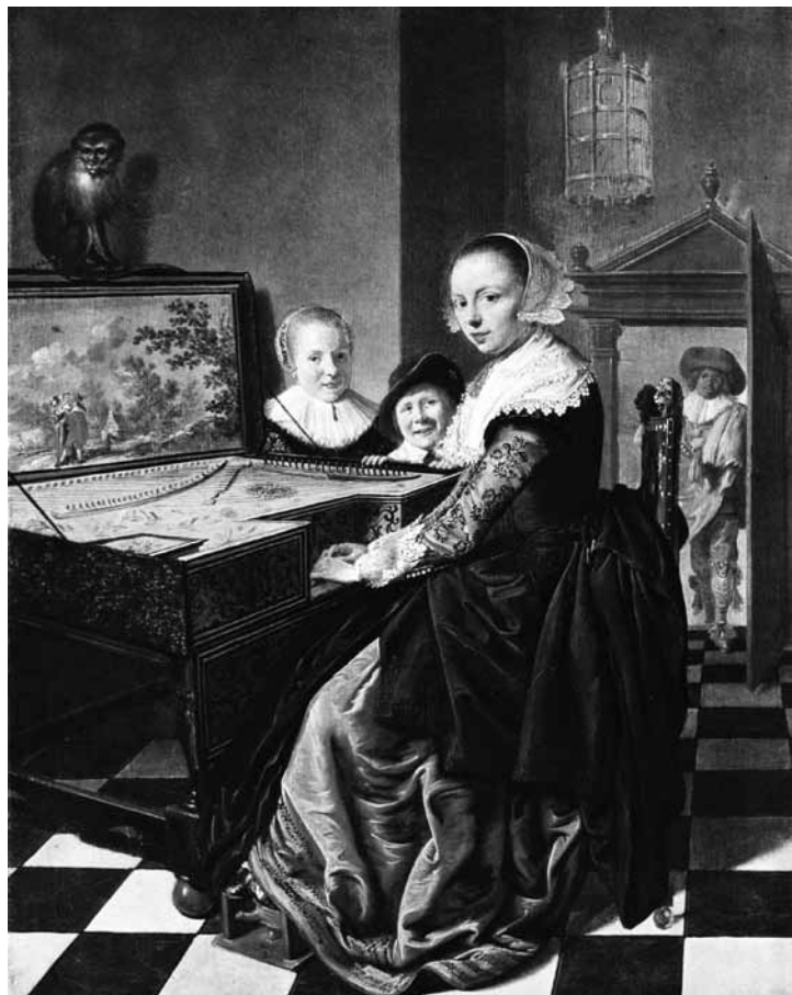
Woman Playing the Virginal, Jan Miense Molenaer (1610–1668), between ca. 1630 and 1640, Rijksmuseum Amsterdam, Amsterdam