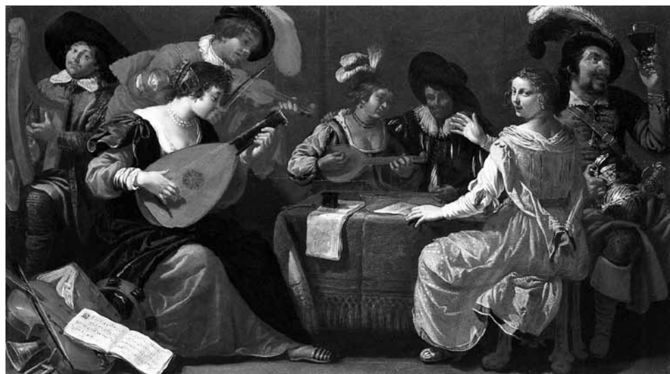
Music-making Company, Jan van Bijlert (1597–1671), c. 1629, Academy of Fine Arts, Vienna